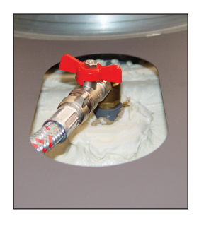
Fig. A (cover)

The appliance is fitted with a safety valve. If the system pressure exceeds 3 bars, this valve opens and drains the water from the system. In this case, contact your installer.